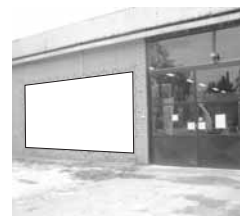
Banner 5 x 3 m