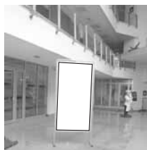
Board 1 x 2 m