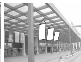
Flag 1,5 x 3 m

SPONSORSHIP PACKAGES AND OTHER PACKAGE OF MARKETING SERVICES ARE CHARGED BY SPECIAL OFFERS. PHONE: + 381 21/483-11-32