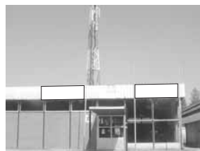
Banner 3 x 1,5 m