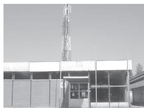
Banner 3 x 1,5 m