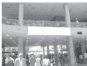
Banner 5 x 1 m