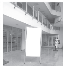
Board 1 x 2 m