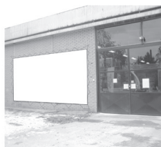
Banner 5 x 3 m